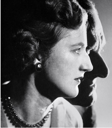
Valerie Eliot (with TSE) 1957