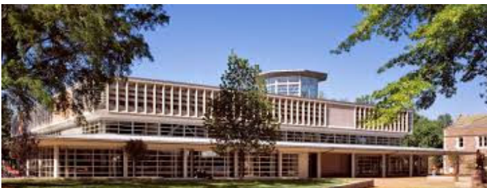
Olin Library, Washington University