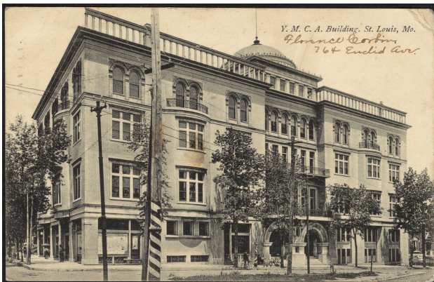
St. Louis Central Y.M.C.A. building from historic postcard

If so, the room he recalled was in this building.