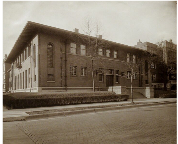
Westminster Place home of the Wednesday Club, 1908-1971