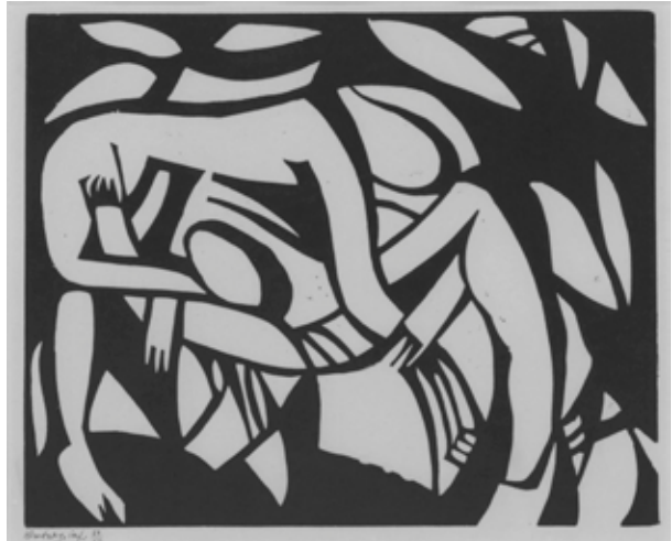
Henri Gaudier-Brzeska, The Wrestlers (linocut, c. 1914)