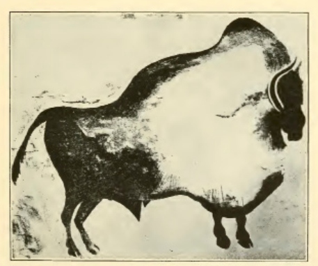
3. b. POLYCHROME PAINTING OF A BISON. CAVERN OF FONT-DE-GAUME (DORDOGNE FOURTH PHASE, 4: AFTER CAPITAN AND BREUIL

Eliot and Pound, accompanied by Dorothy Pound, began their holiday in the village of Excideuil, a town of narrow streets, stone homes, a tenth-century monastery, and gorgeous flora. The sunburnt Eliot considered this a "complete relief from London," and he reveled in the melons, truffles, free-range eggs, "good wine and good cheese and cheerful people" he found there ( Letters 1 388). Leaving Excideuil and Dorothy behind, Eliot and Pound hiked through the small towns of Thivier